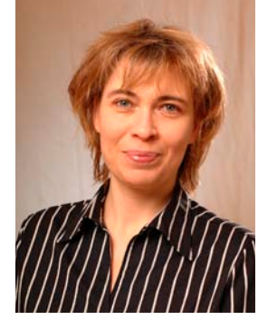
Järvi Kotkas Estonia