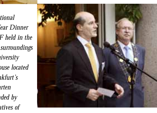
The traditional End-of-Year Dinner of the ILF held in the beautiful surroundings of the University Guest House located near Frankfurt's Palmengarten was attended by representatives of its sponsors and its students, faculty and staff.