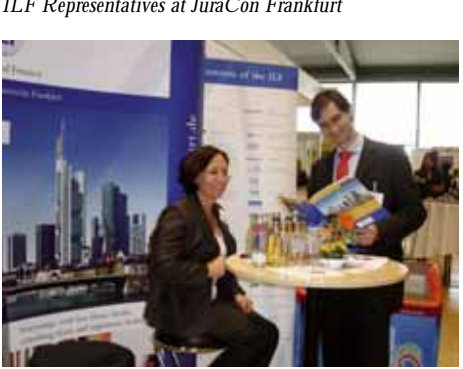
We were delighted by the fact that we were kept really busy the whole day, answering inquiries about both our LL.M. Finance and Summer School (Banking and Capital Markets Law) programs.